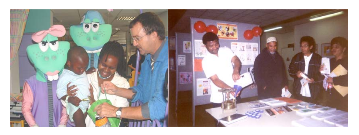
Woolworths' My School characters, Xena and Torak handed our party packs and toys to Red Cross Children's Hospital patients

My School Characters, Xena and Torak handed out party packs and gifts to the patients. Four hundred party packs were distributed to paediatric patients at the following hospitals: Red Cross Children's Hospital, Tygerberg and Groote Schuur Hospitals, St Josephs, Sara Fox, Maitland Cottage, Brooklyn Chest and Princess Alice Hospitals.