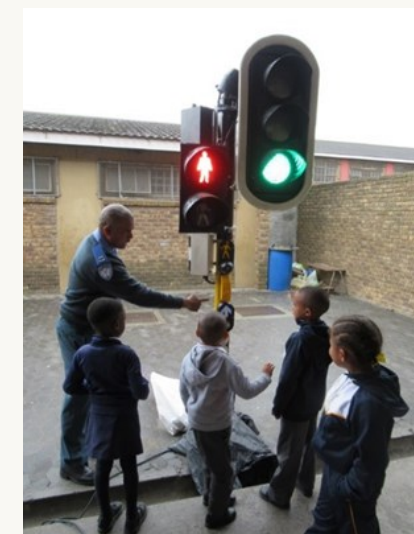
A police officer interacts with learners

Live demonstrations followed to educate learners and enforce road safety measures of where to cross the road safely.