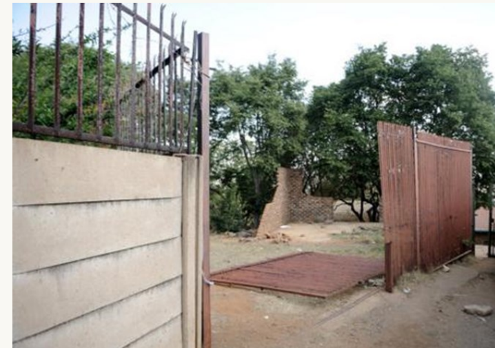
'Killer Gate' which fell on a 3 year old and caused his demise

1. This year's statistical information informs us that there was an increase of children being injured 'caught between'. We have seen a serious increase of children being crushed after heavy security gates came either of the rails or just toppled over while children were playing with it or in the vicinity. These gates can weigh hundreds of kilos and can cause extensive and even lethal damage to children.