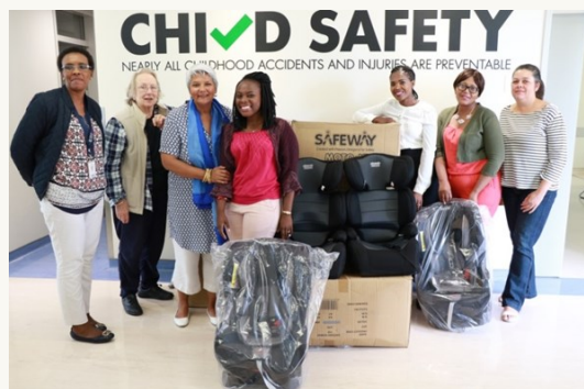
Childsafe team with the donation

These car seats are still being distributed to patients from Red Cross War Memorial Children's Hospital. Childsafe would like to thank Wheel Well for their continued support in creating a safer place for children in South Africa.