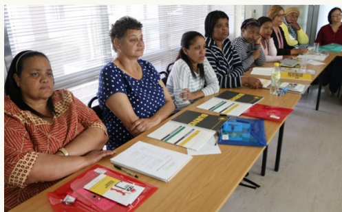
Participants during the training

The two days were well received and the feedback was positive, mainly participants requesting for more of such courses to be arranged for other child carers from their respective communities. Childsafe has planned to run similar courses in 2018.