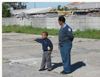
A learner proudly demonstrates what he has learnt

Key lessons followed simple key messages on the dangers of crossing the road; rules on how to cross the road; and where to cross the road. Child road safety messages were communicated in an instructional manner and included interactive and/or illustrative demonstrations by means video clips and 'learning through play'.