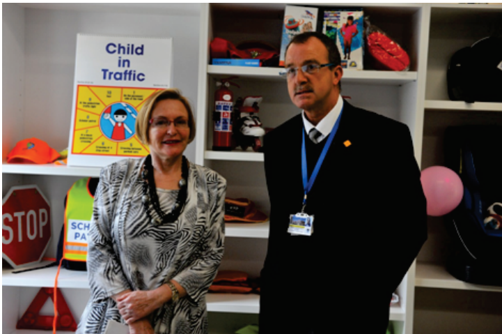
Premier of the Western Cape Premier, Helen Zille