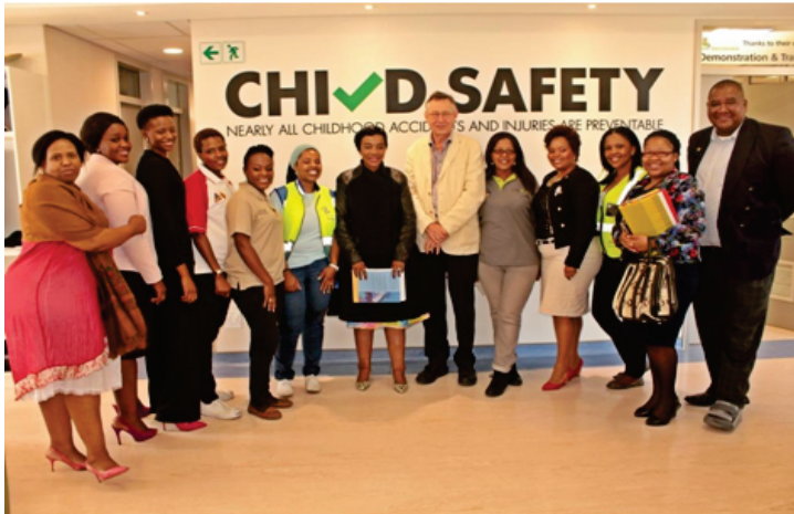
National Deputy Minister of Transport, Ms Lydia Sindisiwe Chikunga

The Childsafe centre has been graced by the presence of high profile people in the last period. The purpose of all the visits was mainly to see and acknowledge the tremendous work that Childsafe has been doing.