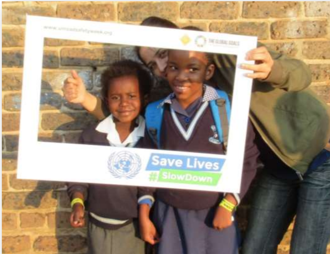
Giyani Primary School, Kliptown, Soweto, JHB, 2017